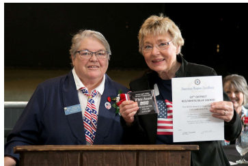
White Award – Fall Creek Unit #376 Community Service Projects