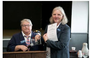
Blue Award – Cadott Unit #159 Various Memorial Services participation

I appreciate the District staff, Program chairmen, Representatives of the VA Facilities, and County Presidents for your reports and hard work throughout the year!