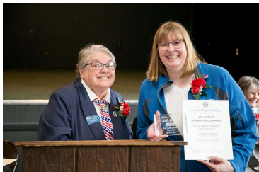
Red Award - Eau Claire Unit #53 Service to veterans/public relations