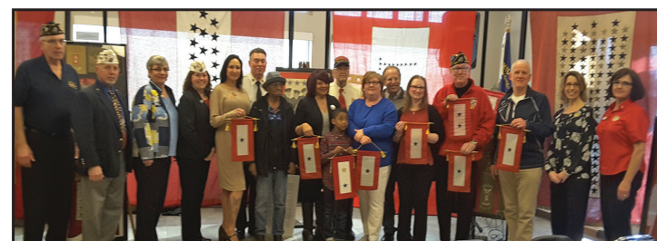
Howard J. Schroeder American Legion Auxiliary Unit 457 in Mequon-Thiensville presented one Gold Star and eight Blue Star flags to families at a "Pride of Our Nation" event on March 10th. The picture includes the families that were presented flags and the officers who were in attendance.