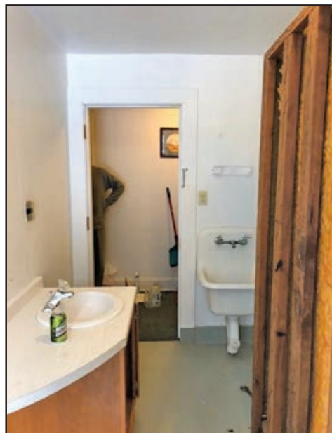
Bathroom 1 "Before"