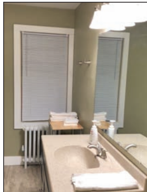
Bathroom 1 "After"