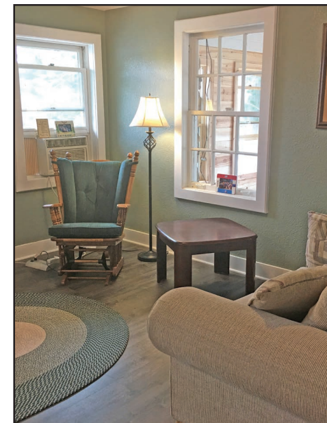
Living Room "After"