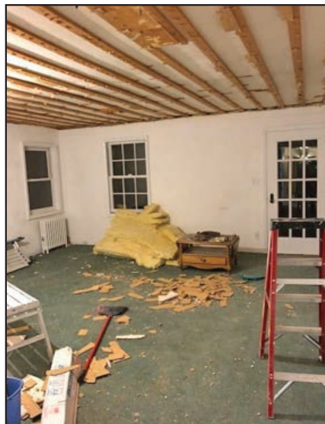
Living Room "Before"

Whew! After many months of hard work, a ribbon cutting event was held in June. Work was suspended during the summer to allow the space to be used, but finishing touches are being done now to finalize the project. Thank you for making this project successful through your donations designated to Camp American Legion!