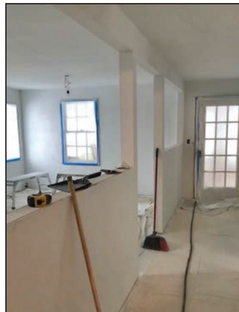
Living Room "During"