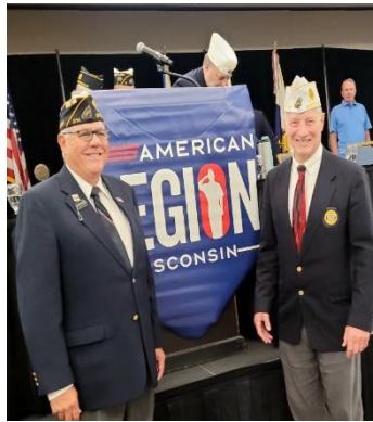
Present and Past Third District Commanders