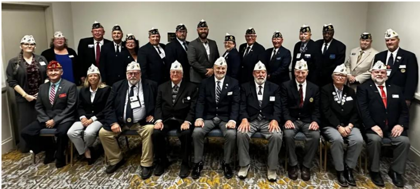
2024 - 2025 DEPARTMENT OF WISCONSIN LEADERSHIP