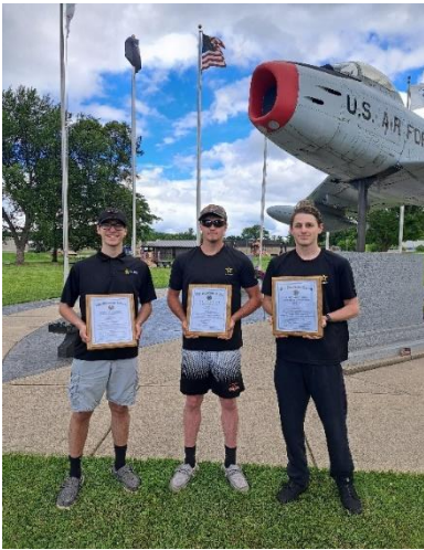
Argyle Post members presented certificates of commendation to three young area men and friends for their commitment to military service.